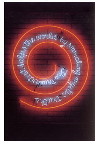
'The True Artist Helps the World by Revealing Mystic Truths (Window or Wall Sign) 1967'

As mentioned earlier – artists need to consider the relationship between exhibiting in a physical open space to the virtual reality of an online environment. Such explorations might bring more enlightenment for the artist and the viewer.