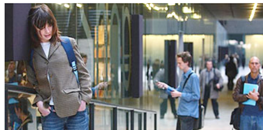
Turbine Hall, Tate modern, 2004

Previous artists, like Anish Kapoor (Marsyas) and Olafur Eliasson (The Weather Project) have filled the Turbine Hall with visual spectacles. Bruce Nauman uses sound only. What was interesting about this installation was its existence on the Internet after the exhibition had finished. The extension of an exhibition onto the Internet would have been impossible 10 years ago. This study will look at the implications that such developments have for computer arts and artists.