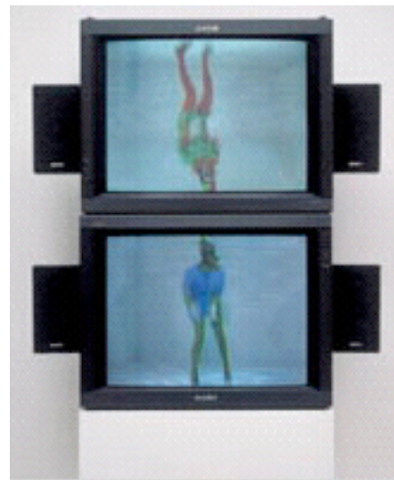
Double No, 1998

Recently, Bruce Nauman exhibited, as part of the Unilever Series, in the Turbine Hall at the Tate Modern. This work, entitled 'Raw Materials', was a sound installation that brought together over 20 recordings of text taken from various works, like 'Double No' (right).